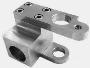
1 ASSEMBLY FROM MACHINED COMPONENTS

ELCEE offers engineered industrial components and assemblies produced at best-cost locations. We specialise in producing small to medium quantities of machined and assembled castings, forgings and welded assemblies. Our engineers will help to transform your components into cost-effective products. We start with your specific requirements and can manufacture in a wide variety of materials, including steel, (duplex) stainless steel, aluminium, iron, brass, metal and plastics. The production and assembly processes we offer include casting, injection moulding, forging, sintering, welding and machining.