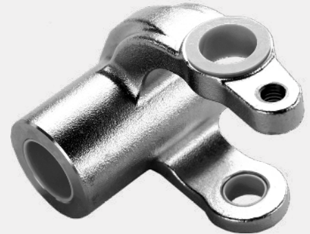
5 FINAL PRODUCT