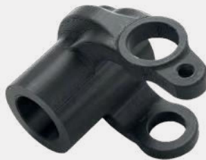
3 PRINTED MODEL